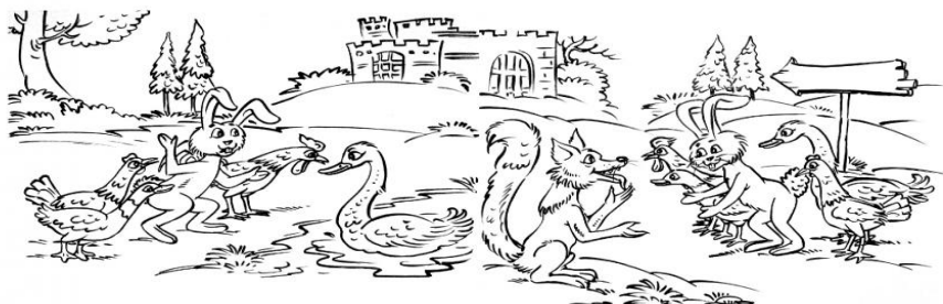
Off they went to find the king.